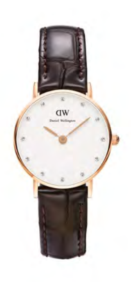
WATCH: 26MM ROSE GOLD STRAP: YORK