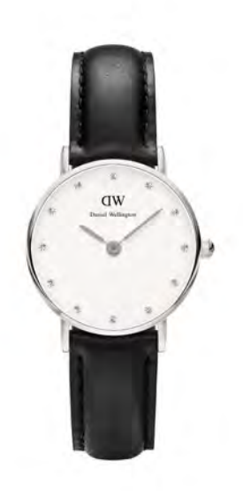
WATCH: 26MM SILVER STRAP: SHEFFIELD