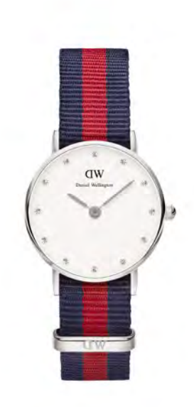
WATCH: 26MM SILVER STRAP: OXFORD