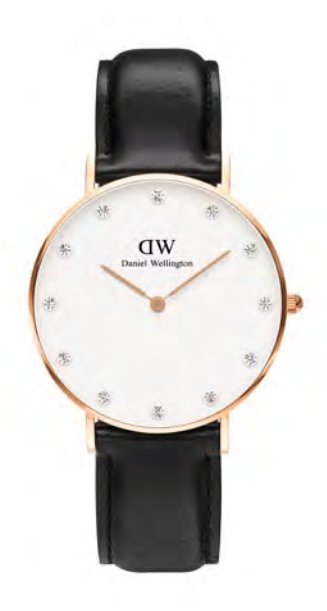
WATCH: 34MM ROSE GOLD STRAP: SHEFFIELD