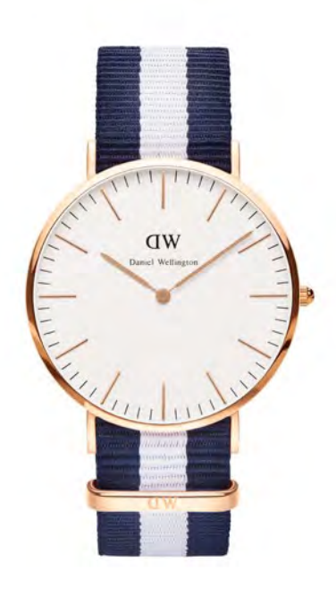
WATCH: 40MM ROSE GOLD STRAP: GLASGOW