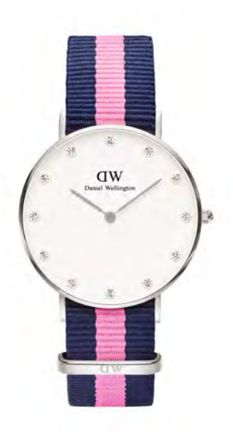
WATCH: 34MM SILVER STRAP: WINCHESTER