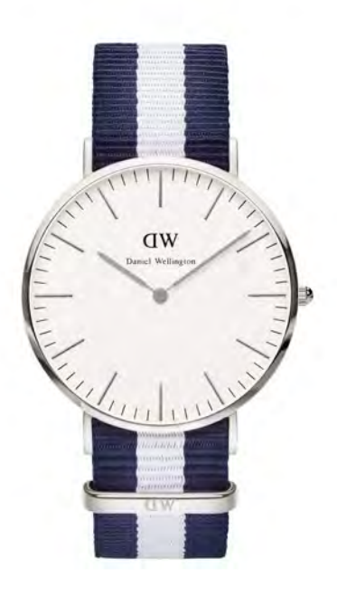
WATCH: 40MM SILVER STRAP: GLASGOW