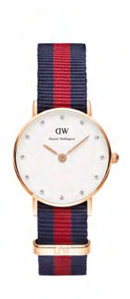
WATCH: 26MM ROSE GOLD STRAP: OXFORD