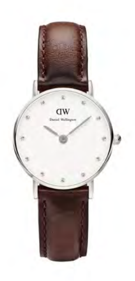
WATCH: 26MM SILVER STRAP: BRISTOL