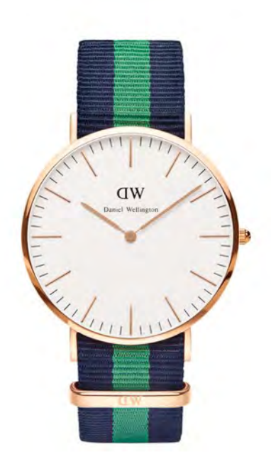
WATCH: 40MM ROSE GOLD STRAP: WARWICK