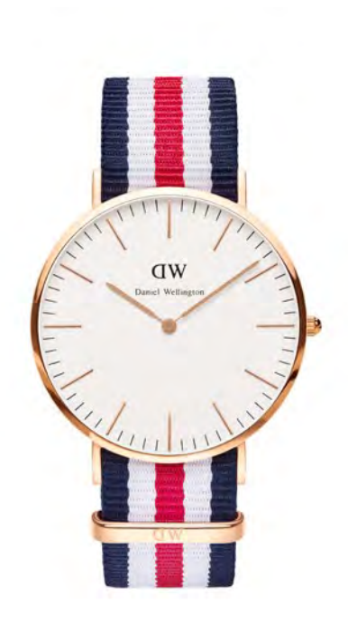
WATCH: 40MM ROSE GOLD STRAP: CANTERBURY