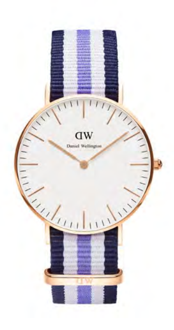
WATCH: 36MM ROSE GOLD STRAP: TRINITY