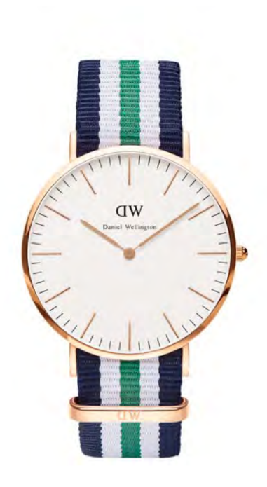
WATCH: 40MM ROSE GOLD STRAP: NOTTINGHAM