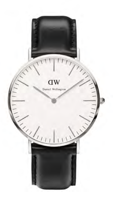
WATCH: 40MM SILVER STRAP: SHEFFIELD