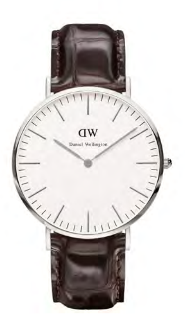
WATCH: 40MM SILVER STRAP: YORK