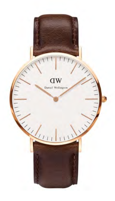
WATCH: 40MM ROSE GOLD STRAP: BRISTOL