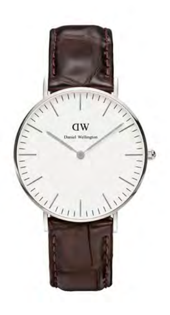
WATCH: 36MM SILVER STRAP: YORK