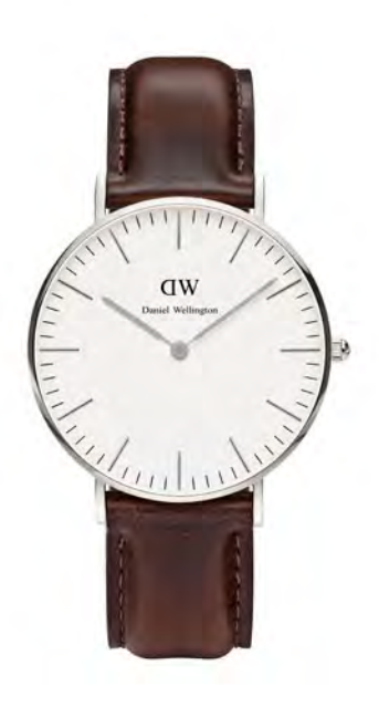
WATCH: 36MM SILVER STRAP: BRISTOL