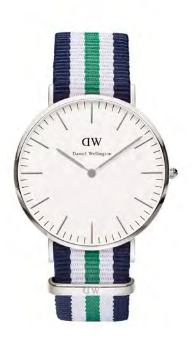
WATCH: 40MM SILVER STRAP: NOTTINGHAM