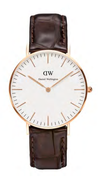
WATCH: 36MM ROSE GOLD STRAP: YORK