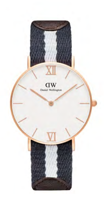
WATCH: 36MM SANDBLASTED ROSE GOLD STRAP: GLASGOW