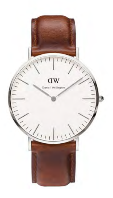
WATCH: 40MM SILVER STRAP: ST MAWES