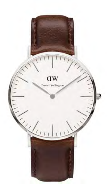
WATCH: 40MM SILVER STRAP: BRISTOL