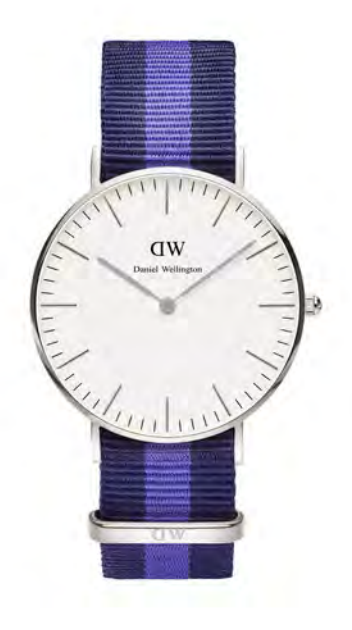
WATCH: 36MM SILVER STRAP: SWANSEA