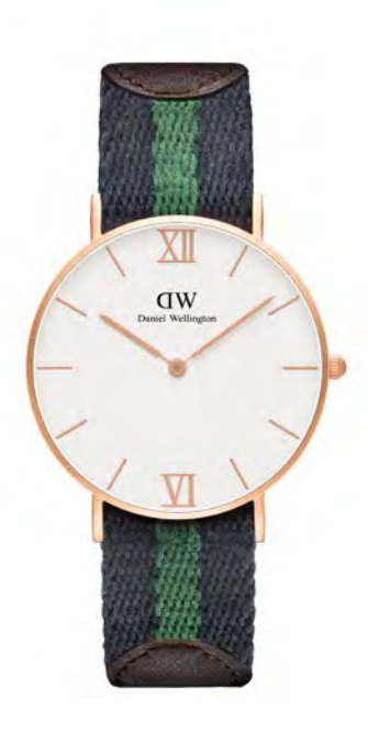
WATCH: 36MM SANDBLASTED ROSE GOLD WATCH: 36MM SANDBLASTED ROSE GOLD STRAP: WARWICK