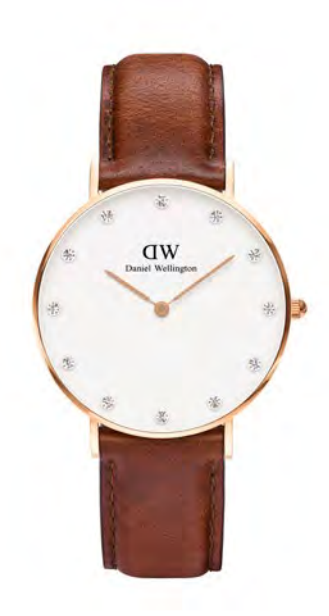
WATCH: 34MM ROSE GOLD STRAP: ST MAWES