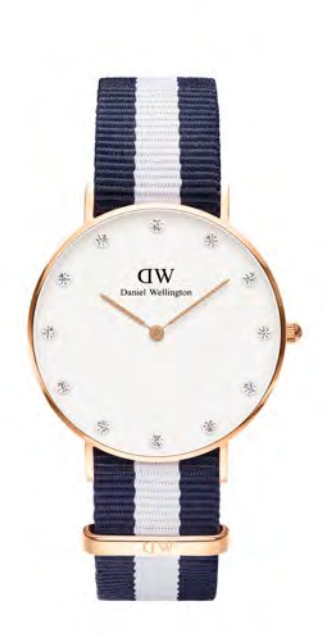
WATCH: 34MM ROSE GOLD STRAP: GLASGOW