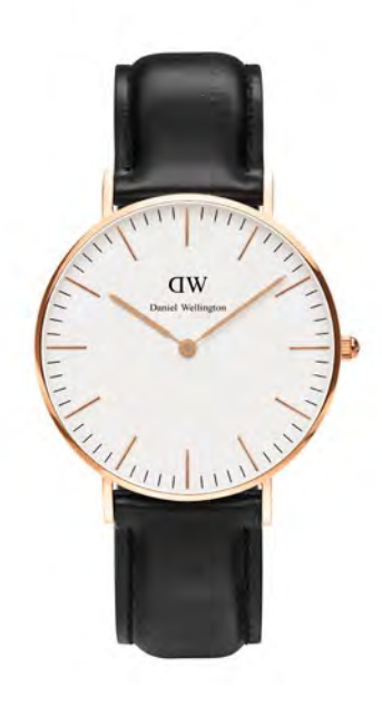
WATCH: 36MM ROSE GOLD STRAP: SHEFFIELD