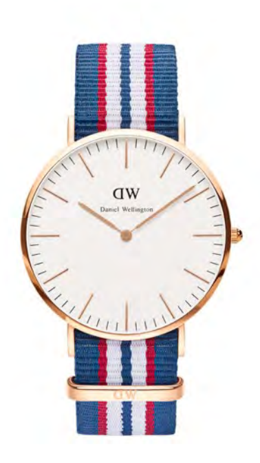
WATCH: 40MM ROSE GOLD STRAP: BELFAST