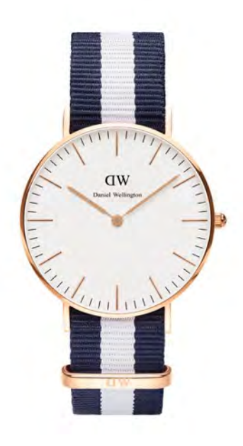
WATCH: 36MM ROSE GOLD STRAP: GLASGOW