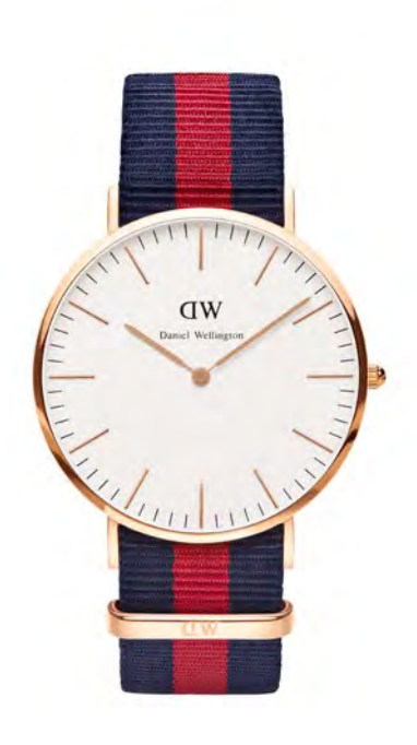
WATCH: 40MM ROSE GOLD STRAP: OXFORD