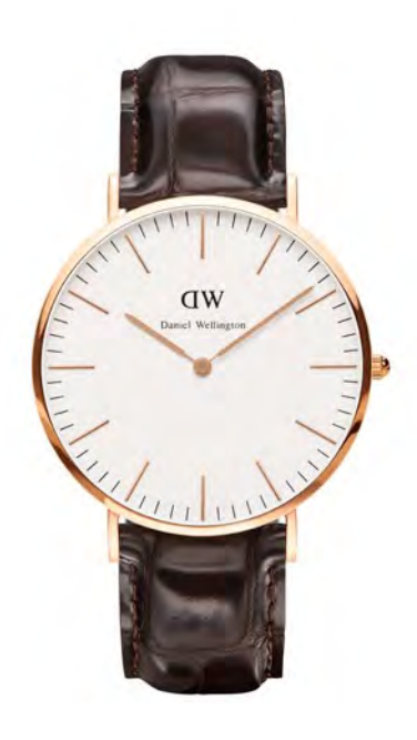
WATCH: 40MM ROSE GOLD STRAP: YORK