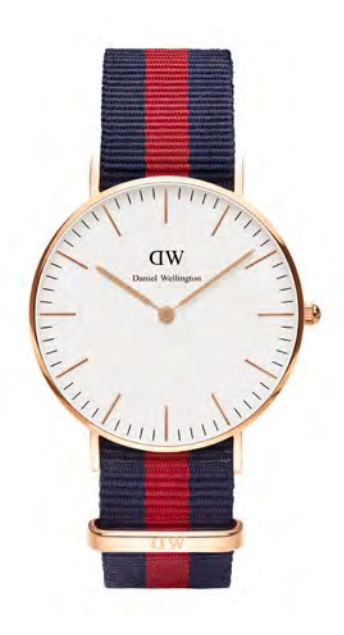
WATCH: 36MM ROSE GOLD STRAP: OXFORD