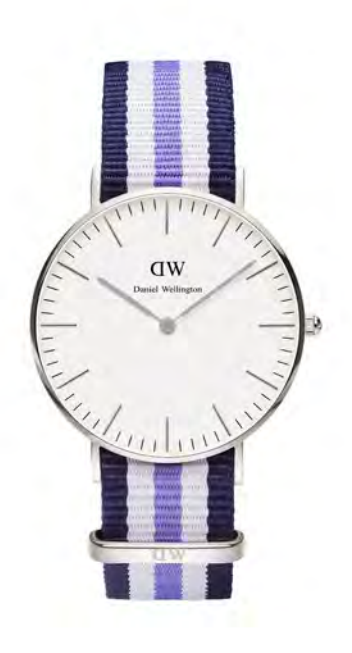
WATCH: 36MM SILVER STRAP: TRINITY