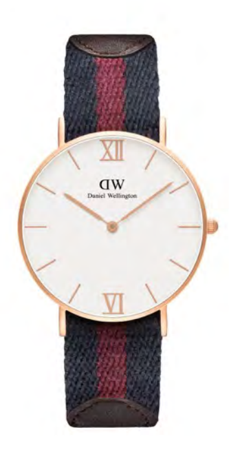
WATCH: 36MM SANDBLASTED ROSE GOLD STRAP: LONDON