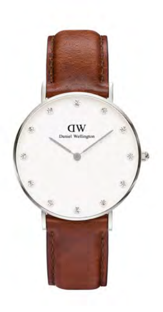
WATCH: 34MM SILVER STRAP: ST MAWES