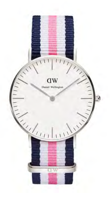
WATCH: 36MM SILVER STRAP: SOUTHAMPTON