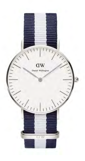
WATCH: 36MM SILVER STRAP: GLASGOW