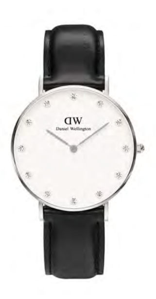
WATCH: 34MM SILVER STRAP: SHEFFIELD