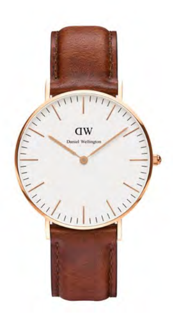
WATCH: 36MM ROSE GOLD STRAP: ST MAWES