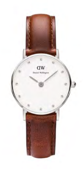
WATCH: 26MM SILVER STRAP: ST MAWES