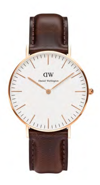
WATCH: 36MM ROSE GOLD STRAP: BRISTOL