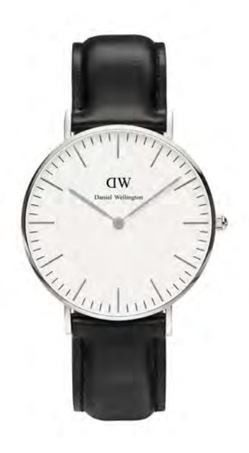
WATCH: 36MM SILVER STRAP: SHEFFIELD