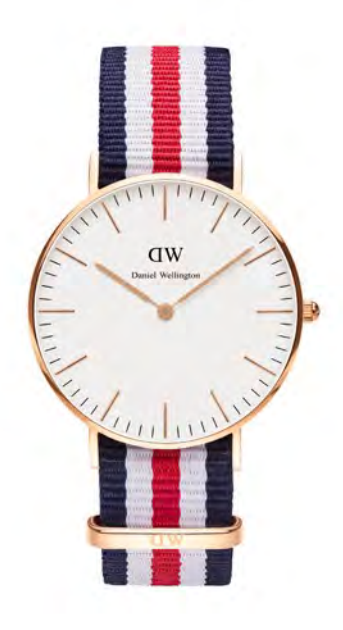
WATCH: 36MM ROSE GOLD STRAP: CANTERBURY