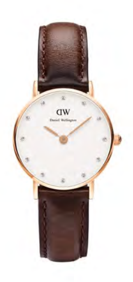
WATCH: 26MM ROSE GOLD STRAP: BRISTOL