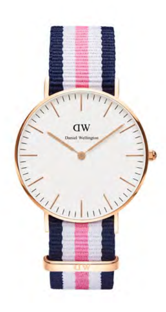
WATCH: 36MM ROSE GOLD STRAP: SOUTHAMPTON