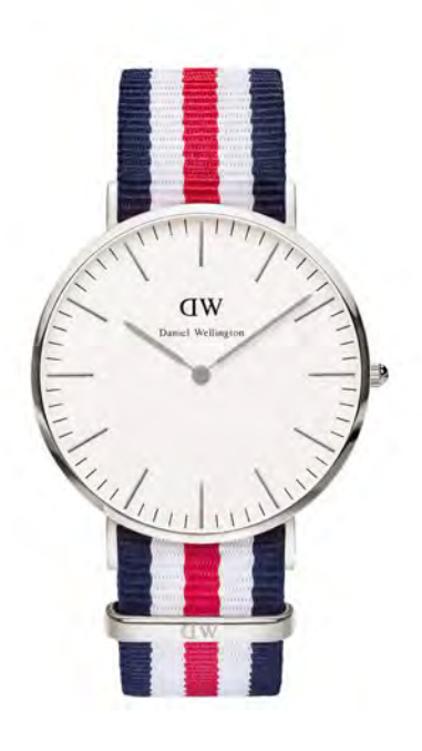
WATCH: 40MM SILVER STRAP: CANTERBURY