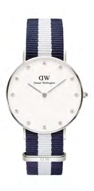
WATCH: 34MM SILVER STRAP: GLASGOW