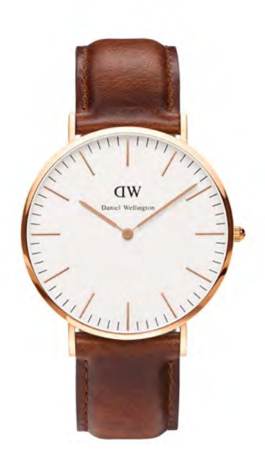
WATCH: 40MM ROSE GOLD STRAP: ST MAWES