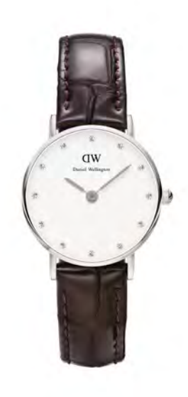
WATCH: 26MM SILVER STRAP: YORK