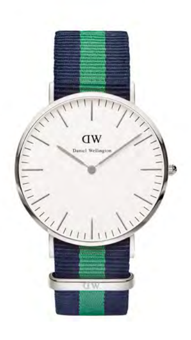
WATCH: 40MM SILVER STRAP: WARWICK