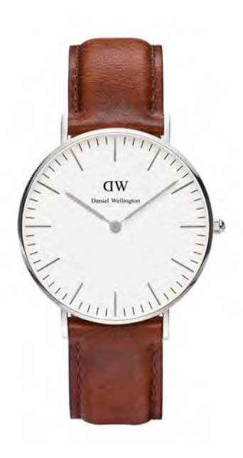
WATCH: 36MM SILVER STRAP: ST MAWES