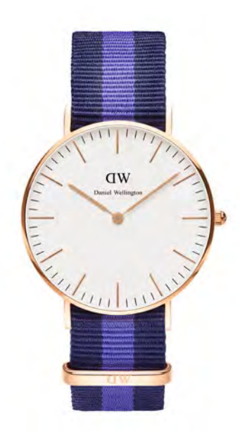
WATCH: 36MM ROSE GOLD STRAP: SWANSEA