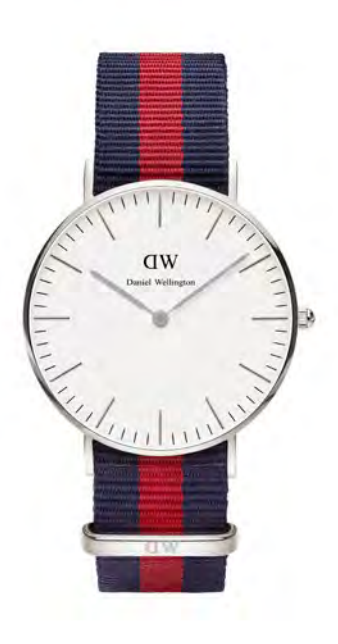
WATCH: 36MM SILVER STRAP: OXFORD