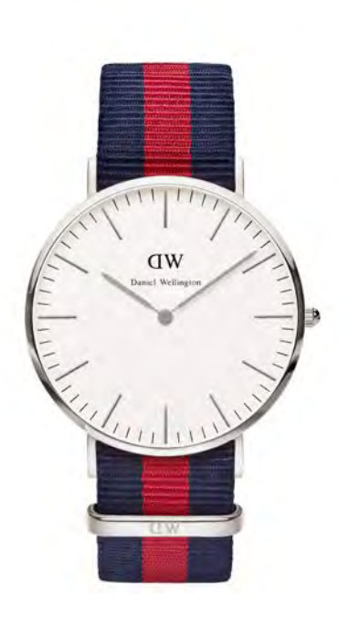
WATCH: 40MM SILVER STRAP: OXFORD