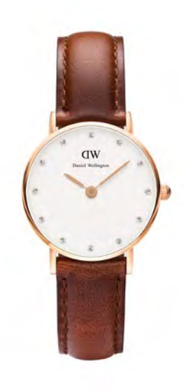
WATCH: 26MM ROSE GOLD STRAP: ST MAWES