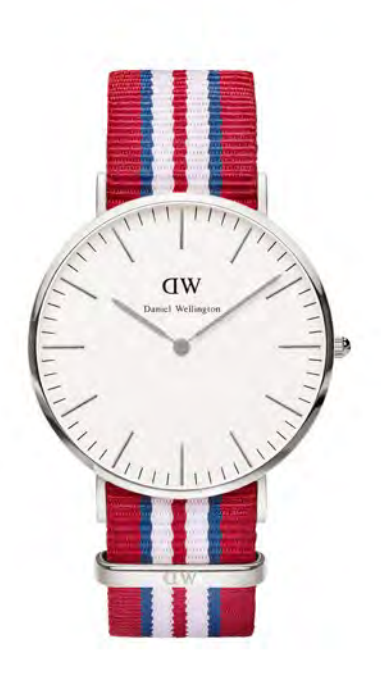
WATCH: 40MM SILVER STRAP: EXETER