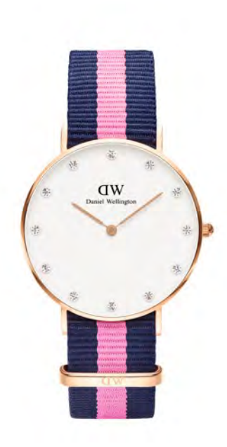
WATCH: 34MM ROSE GOLD STRAP: WINCHESTER