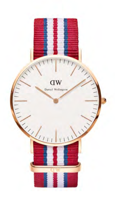
WATCH: 40MM ROSE GOLD STRAP: EXETER