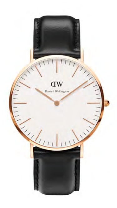
WATCH: 40MM ROSE GOLD STRAP: SHEFFIELD