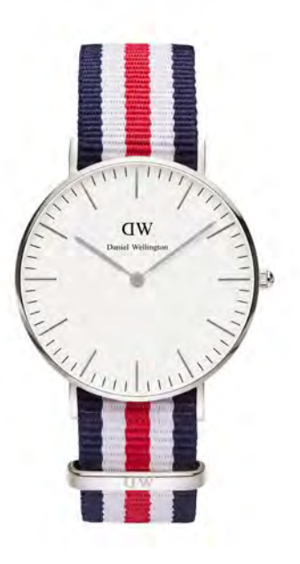
WATCH: 36MM SILVER STRAP: CANTERBURY