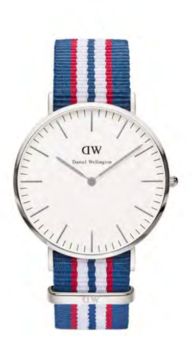
WATCH: 40MM SILVER STRAP: BELFAST